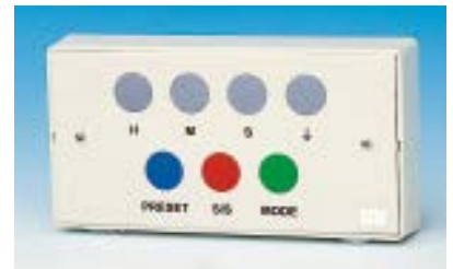
Surface wall mounting

Time keeping in operation theatres Time keeping/measuring in radio- and television studios.