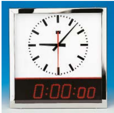
Surface wall mounting